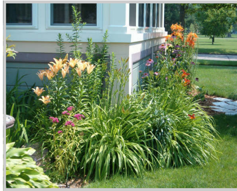
Residence — Brainerd