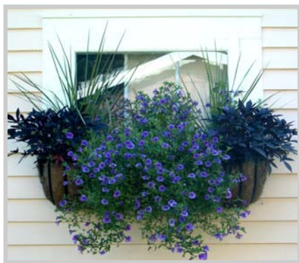
Residence — Brainerd

Certificates will be presented during a ceremony in September at the Northland Arboretum.