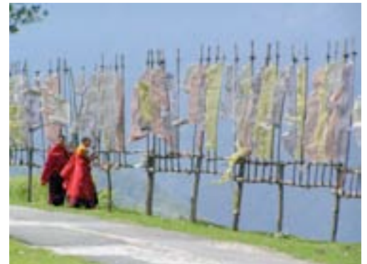
Monks with prayer flags, Bhutan